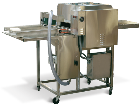
TG50 (rear view)