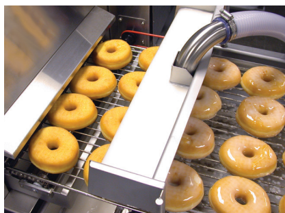
TG50 glazer in operation