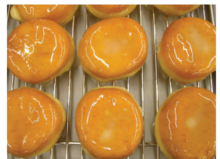
Filled donuts after glazing on TG50