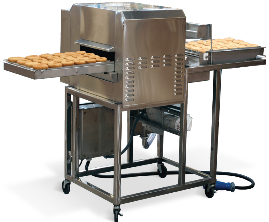
TG50 (front view)