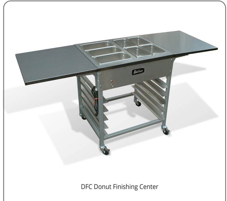
DFC Donut Finishing Center