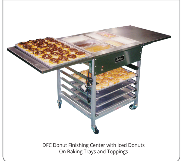
DFC Donut Finishing Center with Iced Donuts On Baking Trays and Toppings