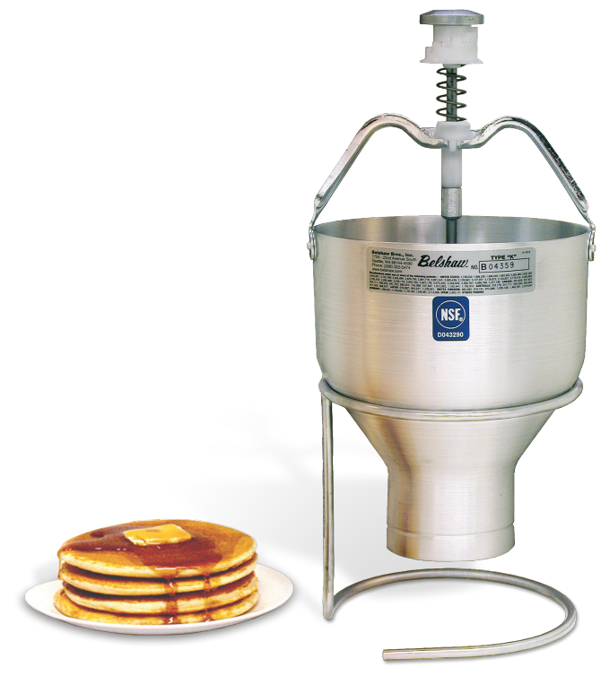
Type K Pancake Dispenser with Holder