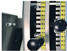
Manually adjustable controls.