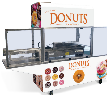
INSIDER with Feed Table extension for yeast raised donuts (optional)