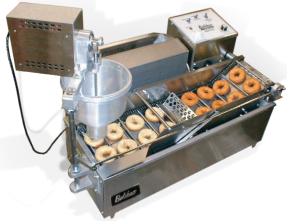
Donut Robot® Mark II Gas with Donuts