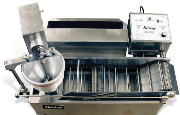
Donut Robot® Mark ii GP Gas (mini donuts only)