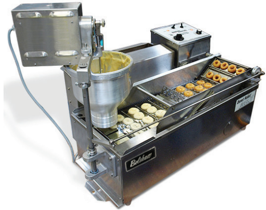
Donut Robot® Mark II Gas with Mini Donuts