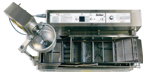
Donut Robot® Mark II - Mark II GP