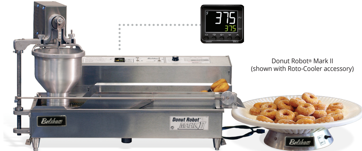
Donut Robot® Mark II (shown with Roto-Cooler accessory)

Mark II • Mark II GP • Mark V • Mark V GP (Electric)