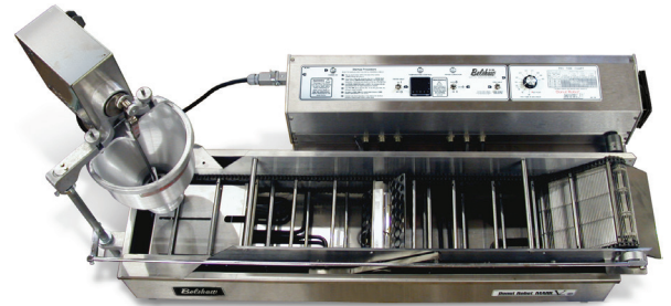
Donut Robot® Mark V - Mark V GP