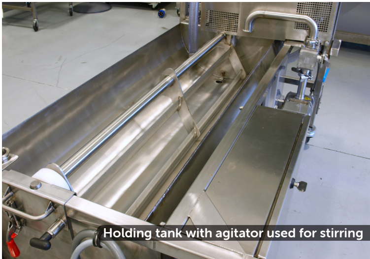
Holding tank with agitator used for stirring