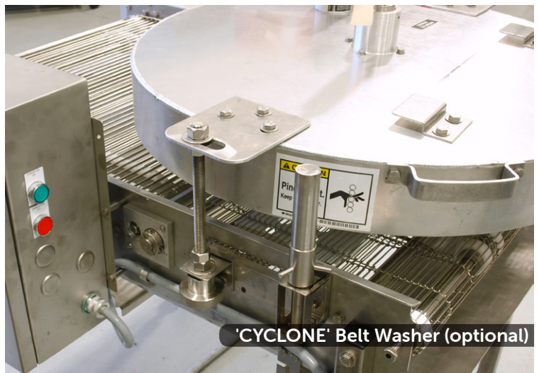
'CYCLONE' Belt Washer (optional)