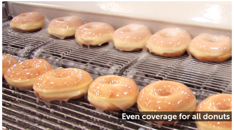
Even coverage for all donuts